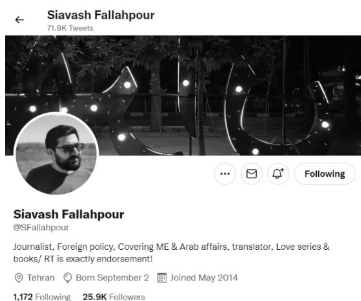
Figure 1. Twitter Account of the Journalator

Following a reverse-chronological order, data collection involved sifting through tweets to identify those meeting the established criteria. We then conducted a meticulous examination of each tweet to identify the specific forms or configurations utilized (e.g., tweets with links, tweets with images, tweet threads). This iterative analysis involved constantly refining the initial set of configurations as we examined new tweets. The process continued until saturation was reached, with more than 300 tweets examined and no new configurations emerging from the data. For each tweet, drawing upon an integrated framework (discussed below), we identified the function(s) of the tweet and its embodiment on Twitter and in translation. This approach ensured a thorough understanding of the diverse paratextual strategies employed by the journalators.