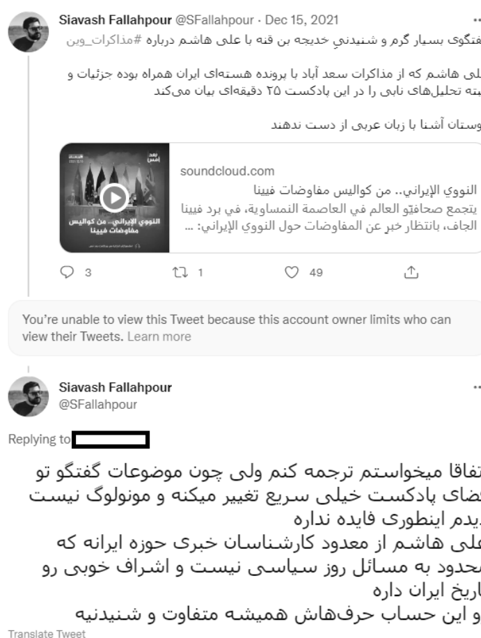
Figure 3. Sharing and Promotion of Content

Like every other paratext, this tweet serves a basic referential function as it makes the text present to readers. The hyperlink serves a navigational role, as it guides the reader to the original content. In the meantime, the journalator's choice for translation serves a hermeneutic function as it highlights a certain segment of the original. Interestingly, this choice may not be exactly the same as the original (the original headline speaks of Russian negligence of Syrian interests, the Persian tweet highlights a joint Iranian-Syrian disgruntlement with Russia's approach).