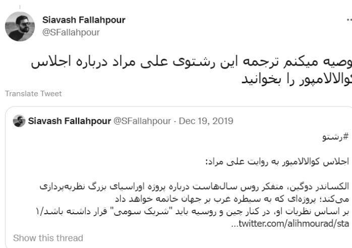
Figure 7. Invitation to Read Translation

A fourth hashtag, i.e. 'رشته تویت' [reshtoo] which stands for 'thread of tweets' in Persian serves a generic function, alerting the readers that they will be reading a series of tweets.