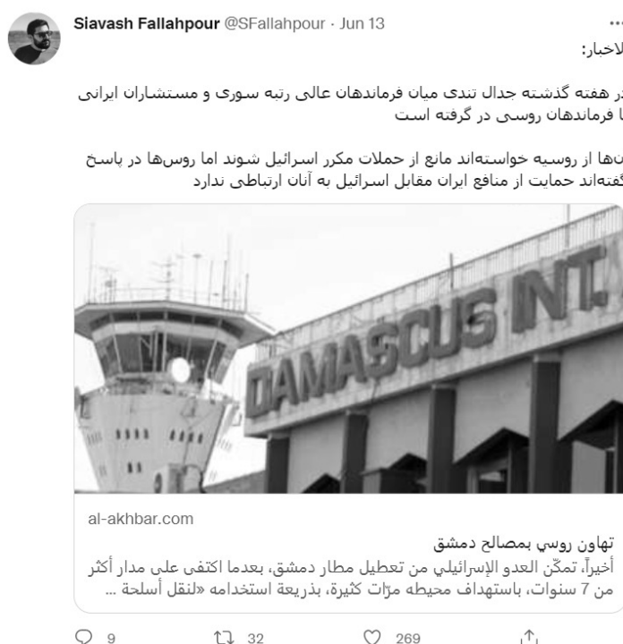
Figure 2. Select Translation and Hyperlink

After unpacking the formal structure of each tweet, the analysis discusses the functional purposes these tweets serve. Moreover, the analysis will address any Twitter-specific or translation-specific nuances that contribute to the paratextual dimension of the tweet. Examining these nuances helps us better understand how the tweet's paratextual function is shaped by its placement within the Twitter platform and the context of journalistic translation.