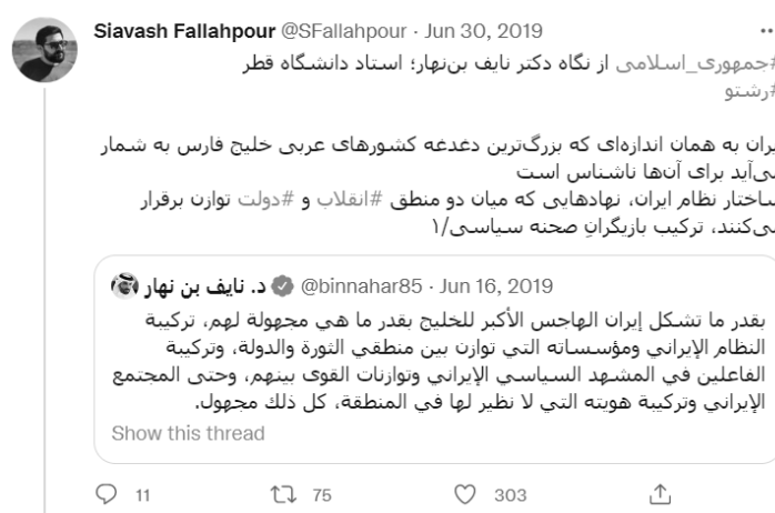
Figure 6. Translation of Twitter Thread

In the meantime, the original tweet (inside the bottom left box) is a paratext in its own right, in form of an excerpt plus link to a report by Bloomberg news outlet. Here, we are witnessing a paratext to a paratext to a text. Technically, this 'chain of paratexts' can be infinite with Twitter's technological capacities, with each tweet serving as a frame to the tweet that it quotes.